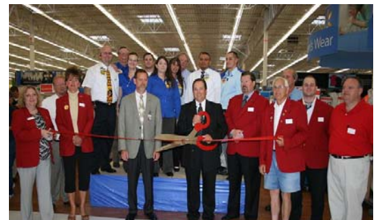
Wal-Mart 5730 Amarillo Blvd. West