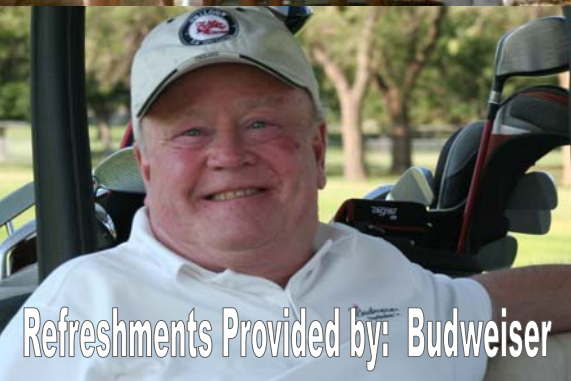
Refreshments Provided by: Budweiser