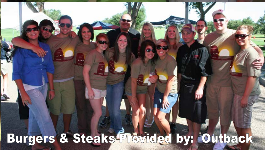
Burgers & Steaks Provided by: Outback