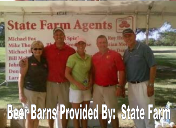
Beer Barns Provided By: State Farm