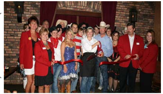
Boot Hill Saloon & Grill 909 Vega Blvd. - Vega

Did you notice? Our Round-Up Club has a new look. They have stepped up their style with new bright red jackets instead of the dated maroon. Round-Uppers are always representing the Chamber well at our ribbon cutting and ground breaking ceremonies, but now they really look great doing it.