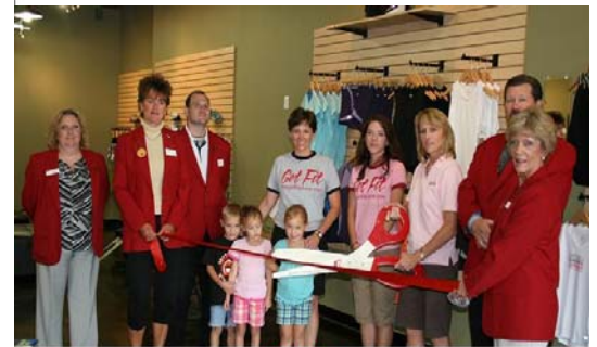
Get Fit 2311 S Georgia