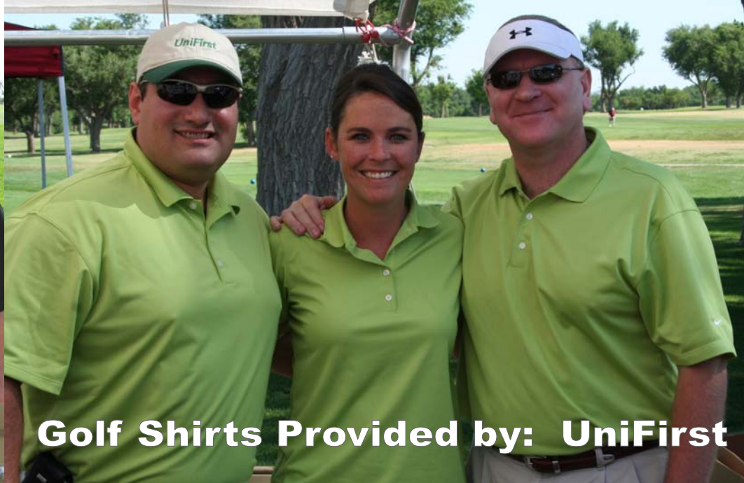
Golf Shirts Provided by: UniFirst