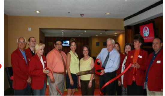
Fairfield Inn 6600 I-40 West