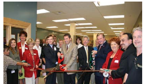
Texas Tech Department of Family Medicine 1400 Coulter