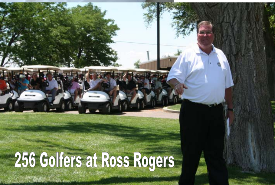
256 Golfers at Ross Rogers