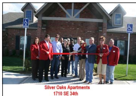
Silver Oaks Apartments 1710 SE 34th