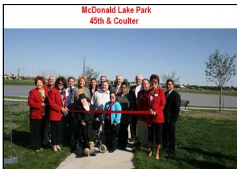
McDonald Lake Park 45th & Coulter