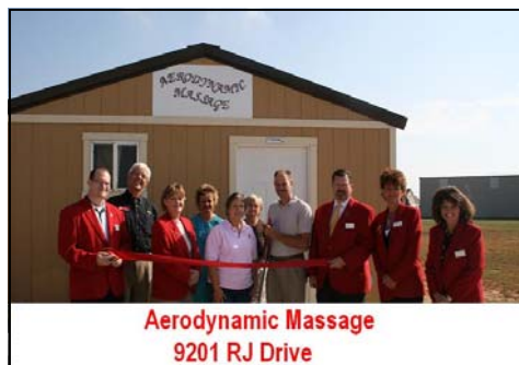
Aerodynamic Massage 9201 RJ Drive

Click on a photo or the Flickr link below to view and download photos.