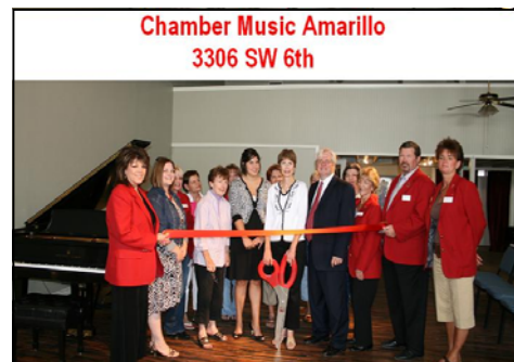
Chamber Music Amarillo 3306 SW 6th