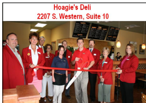
Hoagie's Deli 2207 S. Western, Suite 10