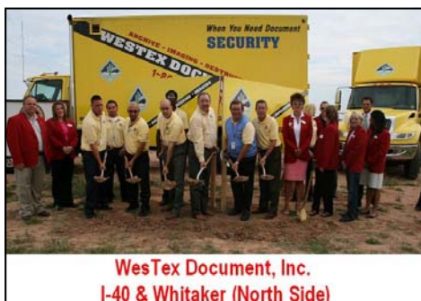
WesTex Document, Inc. I-40 & Whitaker (North Side)