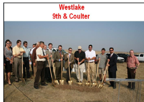
Westlake 9th & Coulter