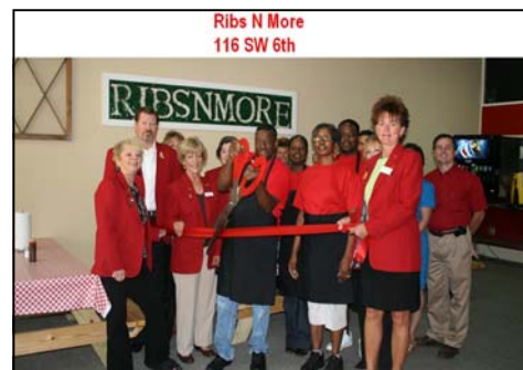
Ribs N More 116 SW 6th