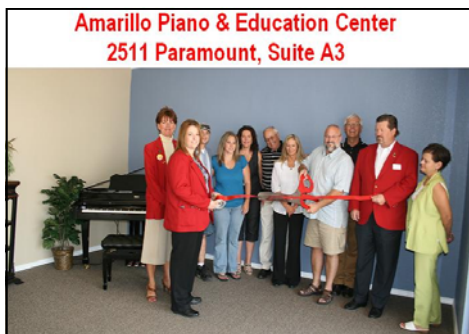
Amarillo Piano & Education Center 2511 Paramount, Suite A3