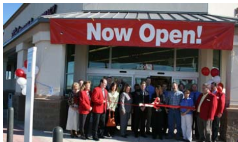
Walgreen's 34th & Ross