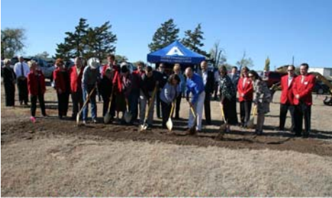
Amarillo Community Federal Credit Union 6030 S Western

Click on a photo or the Flickr link below to view and download photos.