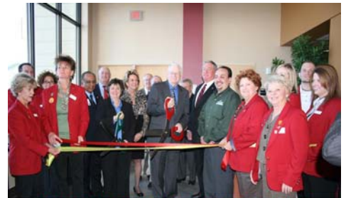
Texas Tech School of Pharmacy Academic Center 1300 S Coulter