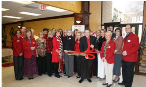
Interim Healthcare Hospice Care 1901 Medipark, Suite 1055