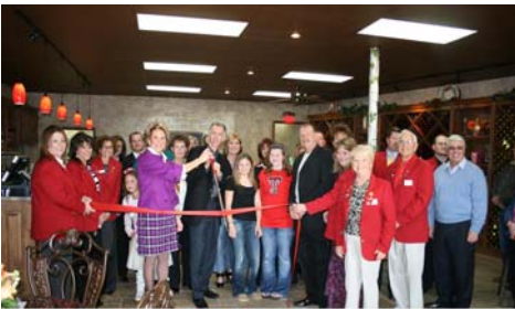
D'Vine Wines 2600 Wolfen Village