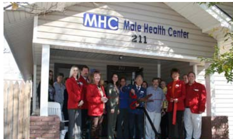
TX Panhandle Family Planning & Health Center Men's Wellness Center - 1501 S Taylor