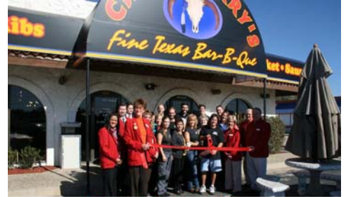
Crazy Larry's Pit Bar-B-Que 4315 Teckla