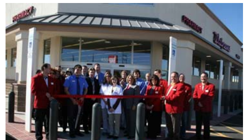
Walgreen's 45th & Western

Contact Linda to schedule your Ribbon Cutting or Ground Breaking event! 342-2006