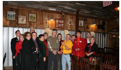
Joint Alliance for Students (JAS) 1503 S Madison