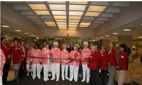
NWTHS Auxiliary 1501 S Coulter