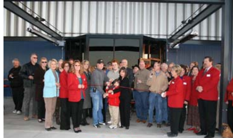
Bar Z Winery 19290 FM 1541